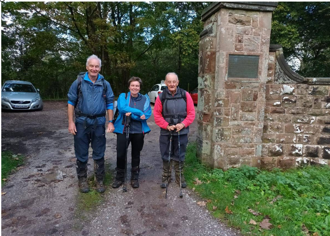
Masefield Memorial Gateway, Hawksmoor Nature Reserve.

conversation revolved around damages of processed food and the merits of home cooking.